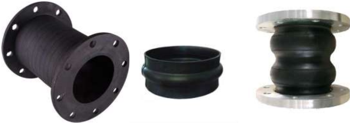
Rubber expansion bellow