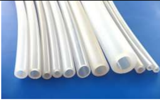
Silicon rubber tube