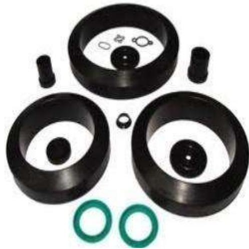
Rubber moulding items.