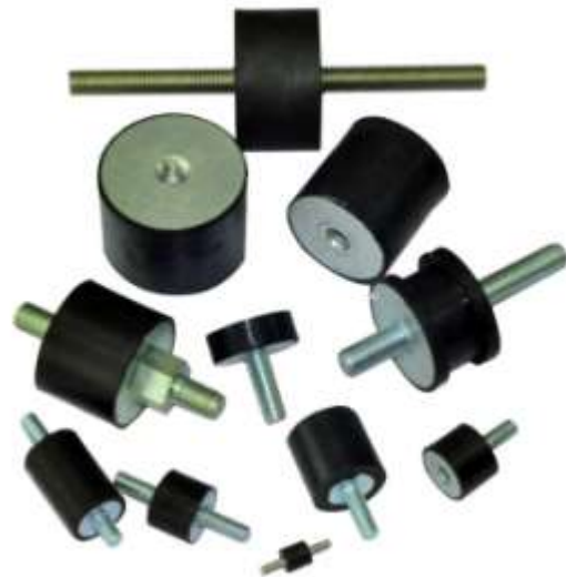
Metal to rubber bonded products