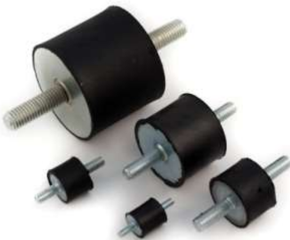
Metal to rubber bonded products